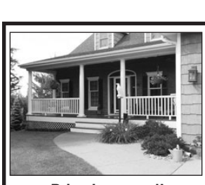
Price Improved! $619,000

Cabin on 1.75 Acres. $65,000. CFD Possible (Unfinished), As is. Call Tom (605)660-1209. America's Best Realty, LLC.