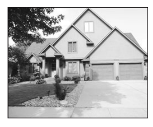
2308 Burleigh NEW PRICE REDUCTION: $319,900

http://www.yankton.net/app/ht ml/1403burleigh/