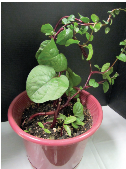
Horticulture "House Plant": Sarala Somepalie