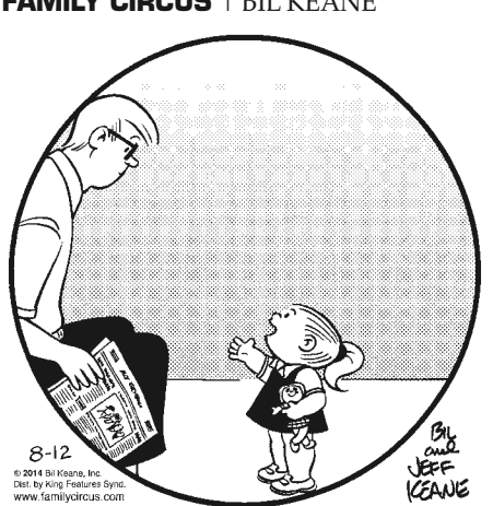
"Daddy, how much above average