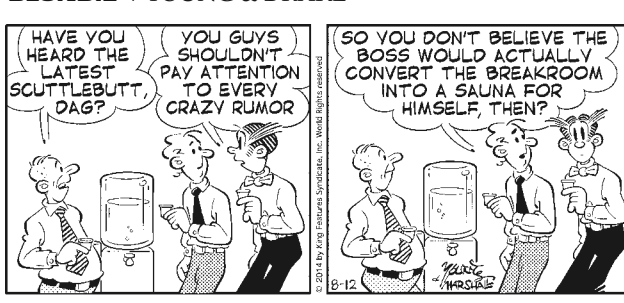
BLONDIE | YOUNG & DRAKE