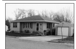
810 Park St. • Price Reduced * $157,000

This 3-bedroom, 2-bath home was completely renovated from the studs up! Almost 2,000 finished square feet. Call Brad Dykes 605-660-1414. Shore to Shore Realty, LLC.