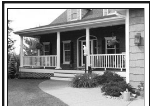
Price Improved! $619,000

Luxury acreage overlooking Jim River Valley. Only 10 minutes to Yankton. For features and photos: www.120crestridgerd.com Brad Dykes (605)660-1414. Shore to Shore Realty, LLC.