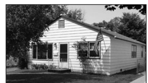
611 Picotte • $89,900