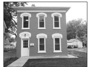
708 Douglas Ave. • Yankton $144,000

Cute, clean, affordable and move-in ready. 2-bedroom, 1-bath, very nice starter home (elementary school just out the back door) OR retirement home with main floor laundry, garage, plus RV/camper pad. Leona (605)660-6078 Anderson Realty.