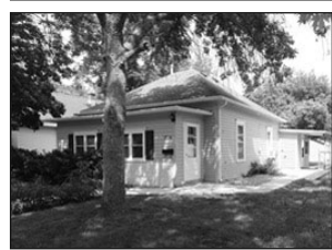
706 Pine • $71,900 New listing