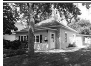
706 Pine • $69,500 Price Reduced

Cute, clean, affordable and move-in ready. 2-bedroom, 1-bath, very nice starter home (elementary school just out the back door) OR retirement home with main floor laundry, garage, plus RV/camper pad. Leona (605)660-6078 Anderson Realty.