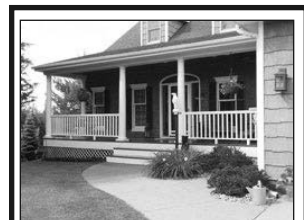
Price Improved! $619,000

Luxury acreage overlooking Jim River Valley. Only 10 minutes to Yankton. For features and photos: www.120crestridge.com Brad Dykes (605)660-1414. Shore to Shore Realty, LLC.