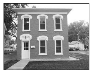
708 Douglas Ave. • Yankton $144,000

Cute, clean, affordable and move-in ready. 2-bedroom, 1-bath, very nice starter home (elementary school just out the back door) OR retirement home with main floor laundry, garage, plus RV/camper pad. Leona (605)660-6078 Anderson Realty.