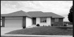
512 E. 29th St. • Yankton $299,900

Perfect summer or year round. 3-bedroom, 2-bath, 1-acre home. Close to lake. (605)661-2134 http://www.yankton.net/app/ht/ml/3306west8th/