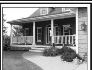
Price Improved! $619,000

Just finishing duplex unit at 1707 West St. For details Jim Tramp (605)661-2192..