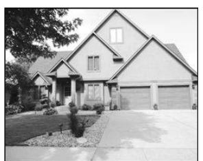
2308 Burleigh NEW PRICE REDUCTION: $319,900

Beautiful 2 story home 4-bedrooms, formal dining, large kitchen, main floor laundry and oversized garage. Call Brad Dykes (605)660-1414. Shore to Shore Realty, LLC.