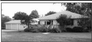
112 Homestead Lane $149,900

3-bedroom, 1-bath, 3-car detached garage. Large deck, 1-acre yard. 5-minutes to Lake. (605)370-1027.