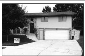
1506 Jo Lane • $163,000

3-bedroom, 1-bath, 3-car detached garage. Large deck, 1-acre yard. 5-minutes to Lake. (605)370-1027.