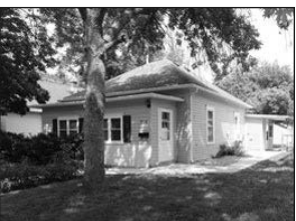
706 Pine • $69,500 Price Reduced

Beautiful townhome in quiet, convenient neighborhood on Fox Run golf course. Low Association membership. Spacious, quality construction with spectacular views. See to appreciate. (605)260-5080. www.yanktontownhomes.com