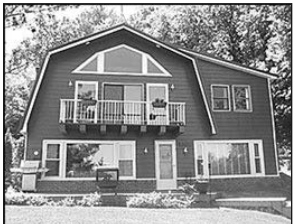
54897 897th Rd. #12 Walker Valley • $252,500