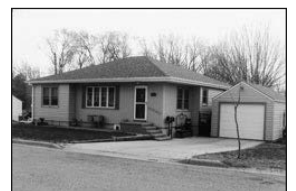
810 Park St. •

This 3-bedroom, 2-bath home was completely renovated from the studs up! Almost 2,000 finished square feet. Call Brad Dykes 605-660-1414. Shore to Shore Realty, LLC.