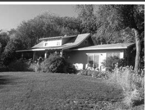
3306 W. 8th St $107,500

Now building townhouses at 602-606 Sawgrass Street. 1,229 sq.ft.+/- units with 3 bedrooms, 1.5 baths, attached 2-car garage, covered patio. (605)661-8003 or (605)661-2400.