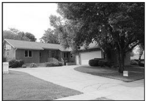
2603 Pine • $319,000

4-bedroom, 2-bath, 2-story, hardwood floors, many updates, golf-course frontage. Deb, Vision (605)661-9398.