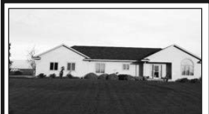
31085 451st Ave. Gayville, SD $265,000