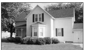
204 Brown St • Gayville $139,900

Split level on a quiet cul-de-sac. 1,200 sq.ft. on main floor. 3-bedroom, 2.50 bath, 2-car garage. Fireplace, sprinkler system. (605)665-6591 (605)661-2134 http://www.yankton.net/app/ht/ml/1506jolane/