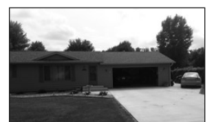
OPEN HOUSE Sunday, 8/30, 1pm-4pm