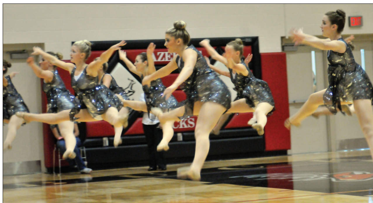
Yankton Dance Team (2013 Jazz Routine)