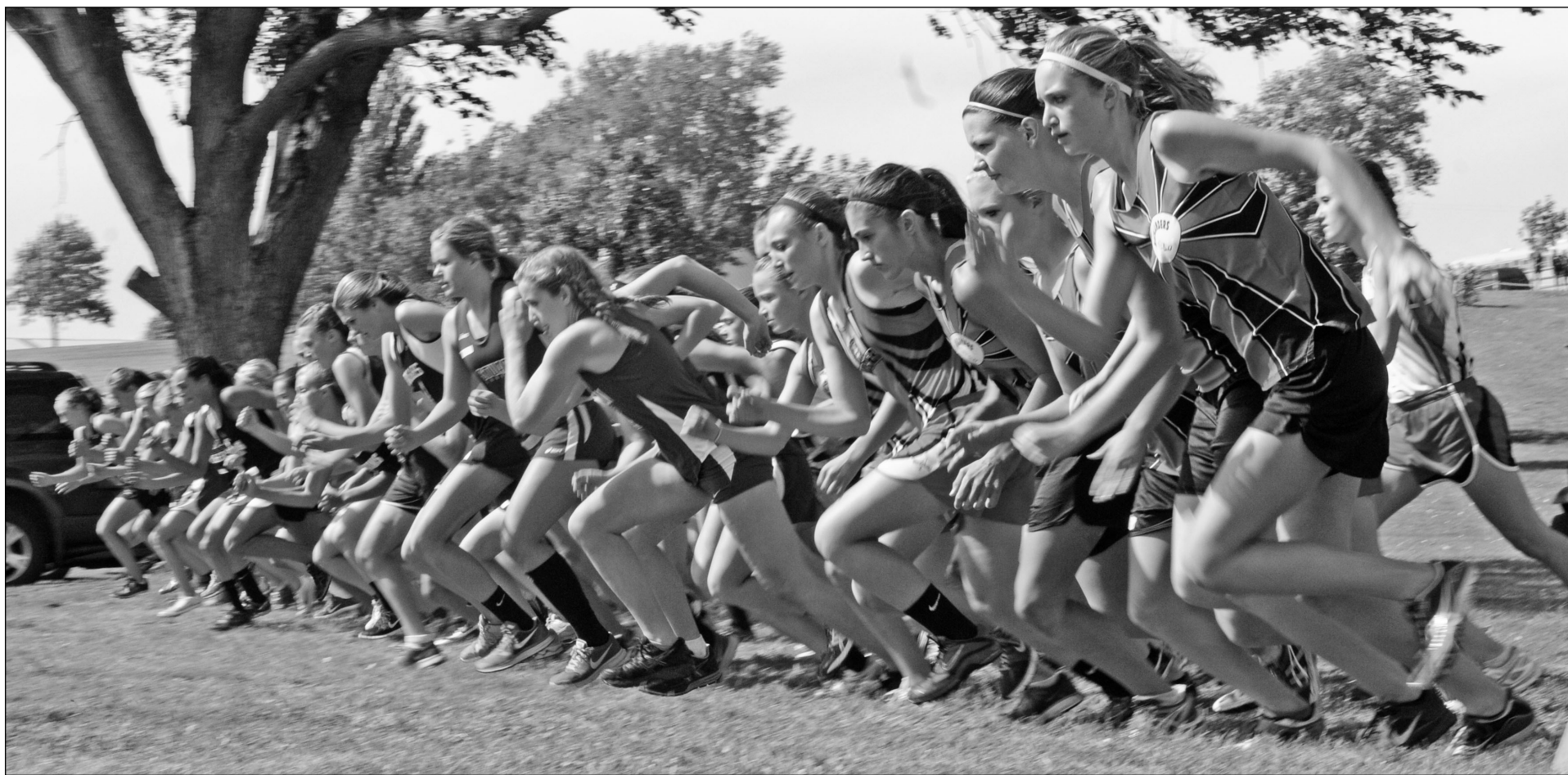
Off To The Races (2013 Bon Homme Invitational)