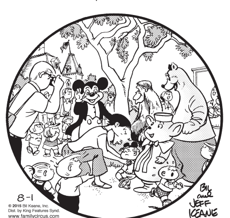
"They have LOTSA animals here! Why couldn't we bring Barfy and Sam?"