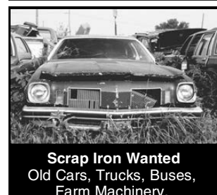
Old Cars, Trucks, Buses, Farm Machinery, Grain bin removal. Roll off dumpsters Paying top dollar. Will pick up. Gubbels Salvage