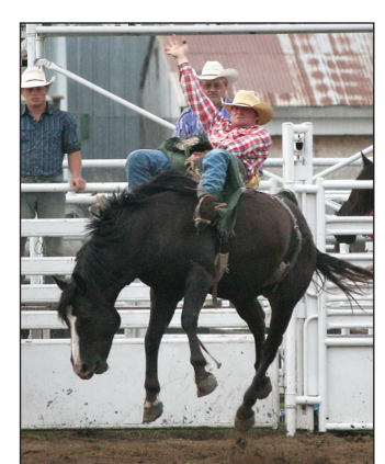
Scotland Rodeo Ready For 50th Anniversary