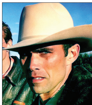
Yankton Native Has Part Of Independent Film RIVER CITY | 1B