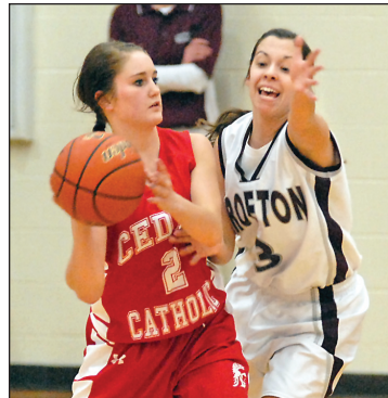
Local High School Basketball Season Tips Off SPORTS | 8A