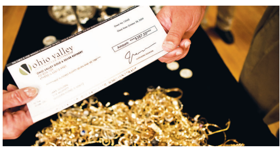
Above: Refinery representatives will be on hand starting tomorrow through Saturday to purchase all gold, silver and platinum items, as well as coins. Public welcome!

Local records reveal to our research department that recent vintage guitar sold for $2400.00 and another for $12,000.00 to a collector that will be tied into the event this week via live database feed.