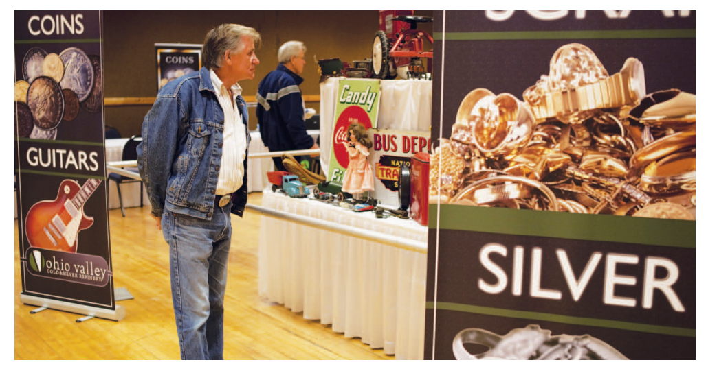
Above: Refinery representatives will be on hand starting tomorrow through Saturday to purchase all gold, silver, pre-1970 coins and platinum items. Public welcome!