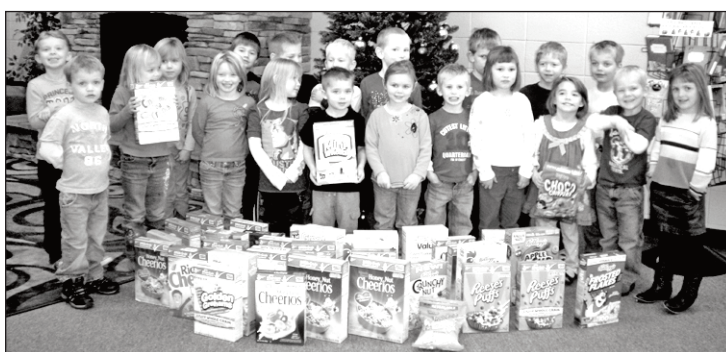
St. John's Preschoolers got into the spirit of giving this season and collected boxes of cereal for the contact center. The kids collected a total of 43 boxes of cereal to help those in need this holiday season.