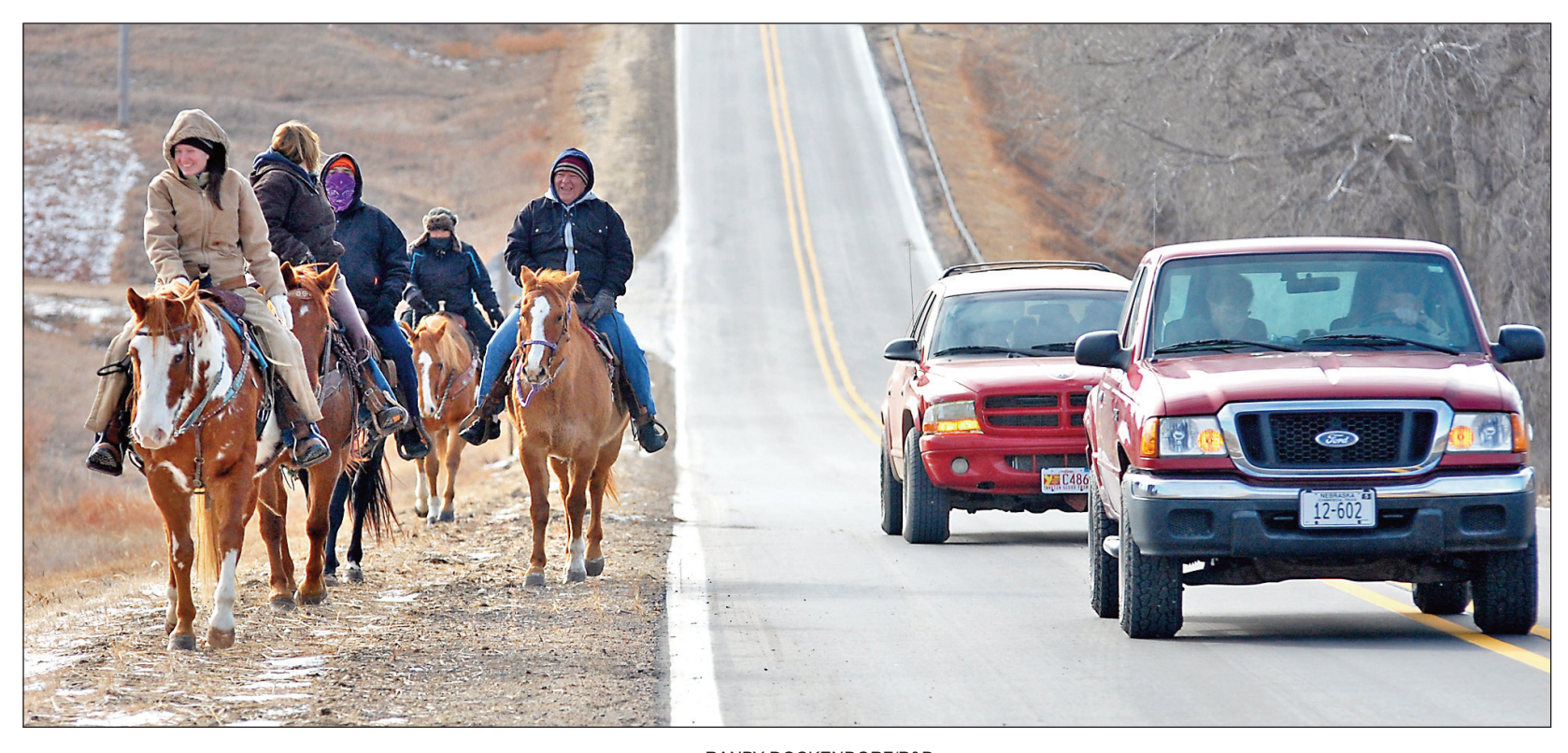
Horseback riders participate in Wednesday's trail ride, commemorating the 150th anniversary of

the hanging of 38 Santee Sioux at Mankato, Minn. The five-mile ride along the highway segment led to Santee, Neb., and a special meal and program.