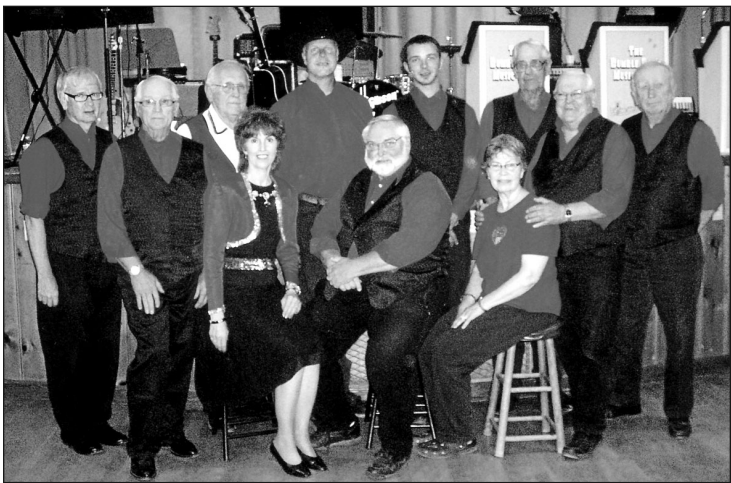
The Bumble Bees perform at The Center's New Year's Eve party on Monday, Dec. 31.