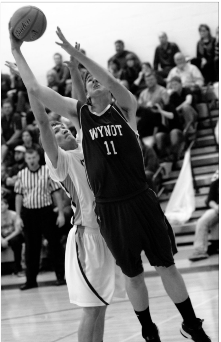
JAMES D. CIMBUREK/P&amp;D

SULLY BUTTES..... 11 32 50 64 WESSINGTON SPRINGS (1-4)..... 12 15 27 36