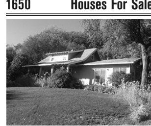
3306 W. 8th St $105,000

3-bedroom house on 1 acre close to Lewis & Clark Lake. 2-full bathrooms and large kitchen. (605)661-7868. http://www.yankton.net/app/ht ml/3306west8th/