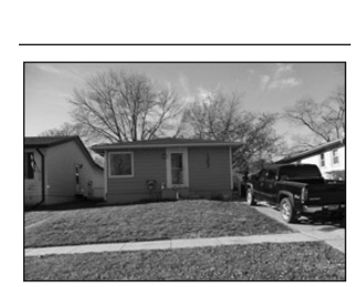
1207 Picotte • $120,000

Spacious 3+ bedroom, 2-bath, 1/3 acre in town. Lisa, Anderson Realty, (605)661-0054.