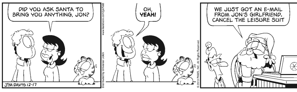
DID YOU ASK SANTA TO BRING YOU ANYTHING, JON? OH, YEAH! WE JUST GOT AN E-MAIL FROM JON'S GIRLFRIEND. CANCEL THE LEISURE SUIT. © 2013 Jim Davis 12-17-13