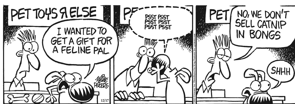
PET TOYS & ELSE I WANTED TO GET A GIFT FOR A FELINE PAL PST PST PST PST PST PST PET NO, WE DON'T SELL CATNIP IN BONGS SHHH © 2013 Mike Peters 12-17-13