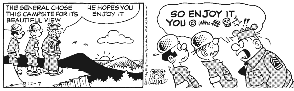
THE GENERAL CHOSE THIS CAMPSITE FOR ITS BEAUTIFUL VIEW HE HOPES YOU ENJOY IT SO ENJOY IT, YOU @##%*!! © 2013 Mort Walker 12-17-13