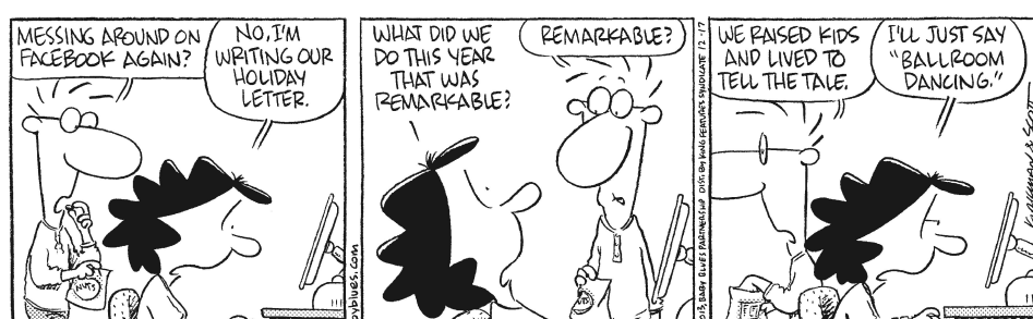
MESSING AROUND ON FACEBOOK AGAIN? NO, I'M WRITING OUR HOLIDAY LETTER. WHAT DID WE DO THIS YEAR THAT WAS REMARKABLE? REMARKABLE? WE RAISED KIDS AND LIVED TO TELL THE TALE. I'LL JUST SAY "BALL ROOM DANCING." 12-17-13