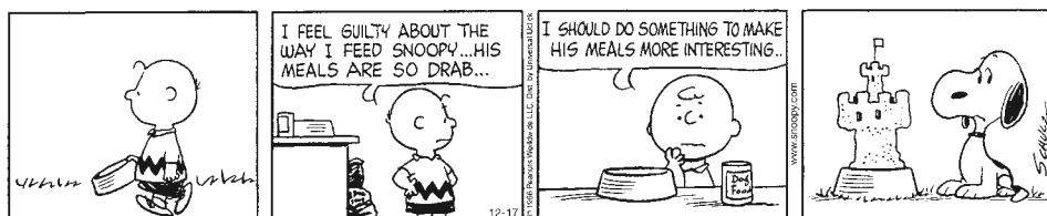
I FEEL GUILTY ABOUT THE WAY I FEED SNOOPY... HIS MEALS ARE SO DRAB... I SHOULD DO SOMETHING TO MAKE HIS MEALS MORE INTERESTING... 12-17-13