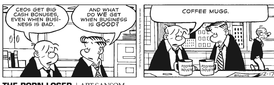
CEOs GET BIG CASH BONUSES, EVEN WHEN BUSINESS IS BAD. AND WHAT DO WE GET WHEN BUSINESS IS GOOD? COFFEE MUGS. 12-17-13