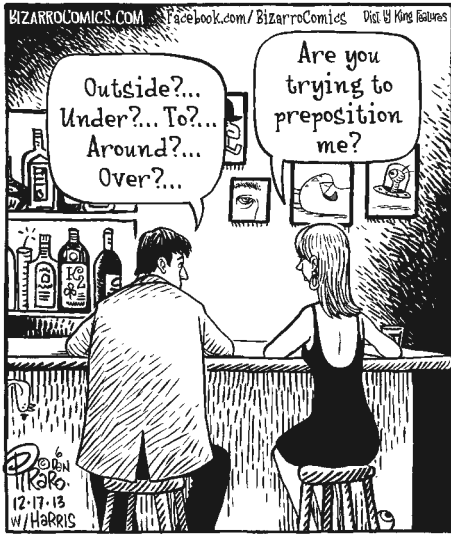
BIZARROCOMICS.COM Facebook.com/BizarroComics Outside?... Under?... To?... Around?... Over?... Are you trying to preposition me? © 2013 Dan Piraro, Inc. 12-17-13 W/HARRIS