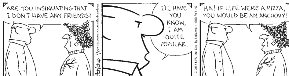
ARE YOU INSINUATING THAT I DON'T HAVE ANY FRIENDS? I'LL HAVE YOU KNOW, I AM QUITE POPULAR! HA! IF LIFE WERE A PIZZA, YOU WOULD BE AN ANCHOVY! © 2013 Art Sansom 12-17-13