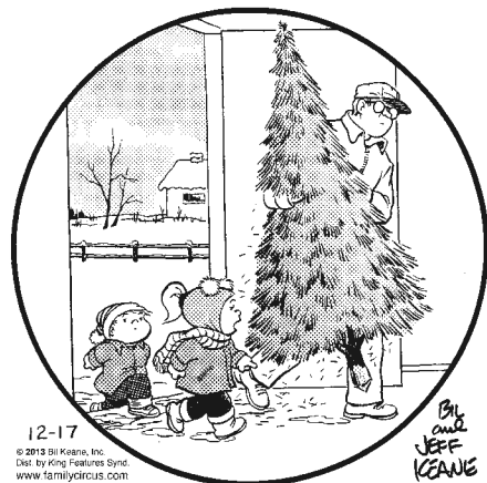
12-17 © 2013 Bil Keane, Inc. All by King Features Syndicate, Inc. www.familycircus.com 'Is it s'posed to be losing its needles already, Daddy?'