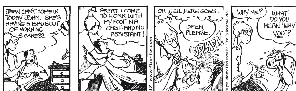
JEAN CAN'T COME IN TODAY, JOHN. SHE'S HAVING A BAD BOUT OF MORNING SICKNESS. GREAT. I COME TO WORK WITH MY FOOT IN A CAST AND NO ASSISTANT! OH WELL, HERE GOES... OPEN PLEASE! WHY ME? WHAT DO YOU MEAN "WHY YOU"? 12-17-13