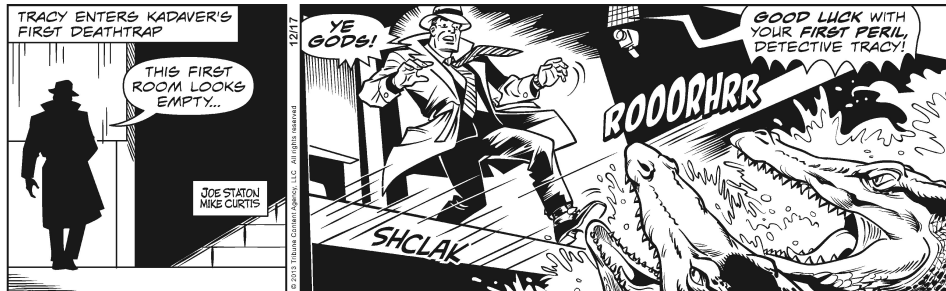
TRACY ENTERS KADAVER'S FIRST DEATHTRAP THIS FIRST ROOM LOOKS EMPTY... JOE STATON MIKE CURTIS YE GODS!! GOOD LUCK WITH YOUR FIRST PERIL DETECTIVE TRACY! SHCLAK ROOOHRR © 2013 Joe Statton and Mike Curtis 12-17-13