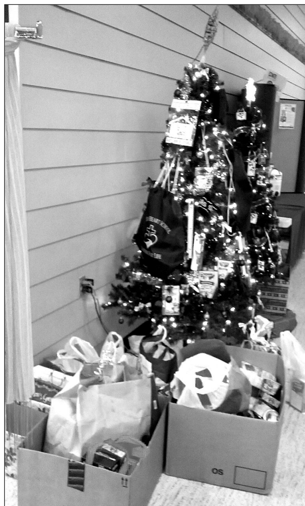
Sacred Heart School was the winner of the Christmas tree contest at the mall. SHS would like to thank everyone who donated food pantry items. We took in 483 items and appreciate the heart warming response from the students; staff; and parents. The $100 prize was turned back to the Contact Center to help a needy family.