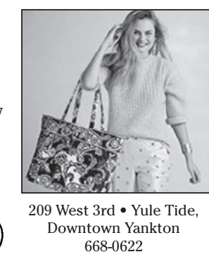
209 West 3rd • Yule Tide, Downtown Yankton 668-0622