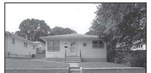
511 Green • $89,900

No step-handicapped accessible, 2-bedroom, 1-bath built in 2000. Lisa, Anderson Realty, 605-661-0054.