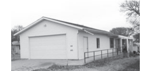
412 Mulberry • $62,500

3-bedroom, 2-bath, great location! www.3099thst.c21.com Jolene Green, Century 21, 605-464-9634.