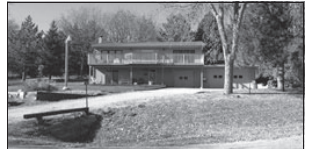
144 Russell Road $259,000

4-bedrooms, 4-bath home Christensen Heights area. Attached garage, heated pool, the entire house has been updated in the past year. 605-661-0057. http://www.yankton.net/app/html/1306maple/index.html