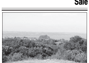
311 th and Colony Road $49,900

5 acres-Beautiful view of the Missouri River Jolene, Century 21 605-464-9634