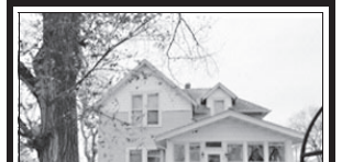
901 Pearl • $104,500

2-bedroom, 1-bath home. Close to schools/parks. Joe, America's Best Realty. 605-661-7264.