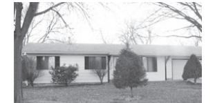
309 9 th St. • Springfield $85,000

Lovely home for sale: 4-bed-5-rooms, 2-bathrooms, walk-in closets. Newly remodeled! New carpet, flooring, kitchen appliances, washer & dryer. 402-418-0058 402-594-9644 http://www.yankton.net/app/html/3007francis/