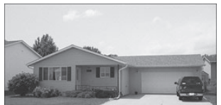
3007 N. Francis $143,500

Twin Home: Spacious 4-bedroom, 3.5 bath, main floor laundry, handicapped accessible, 3-car garage. Diane 605-661-7279 http://www.yankton.net/app/html/2819mary/