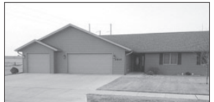
2819 Mary St. • $259,900

3-bedroom, 2-bath, 2,100 sq.ft., on 54 acre lot with .30 acre buildable lot, lake view, many updates. 605-661-6975 or http://www.yankton.net/app/html/144russell/index.html .