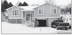
1303 Green St $218,000

4 bedroom, 3 bath, kitchen with custom cabinets, new appliances, master suite, new carpet/paint in basement. Landscaped, built-in sprinklers. 605-760-2953 http://www.yankton.net/app/html/1303green/