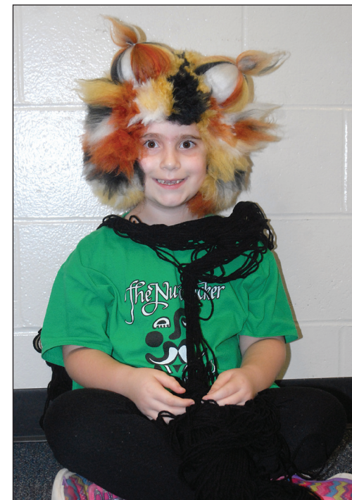
CATS | PAGE 12B