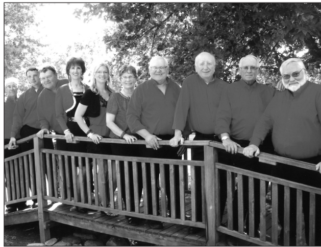
The Bumble Bees will perform on New Year's Eve at The Center, 900 Whiting Drive, Yankton. Showtime is 7 p.m.