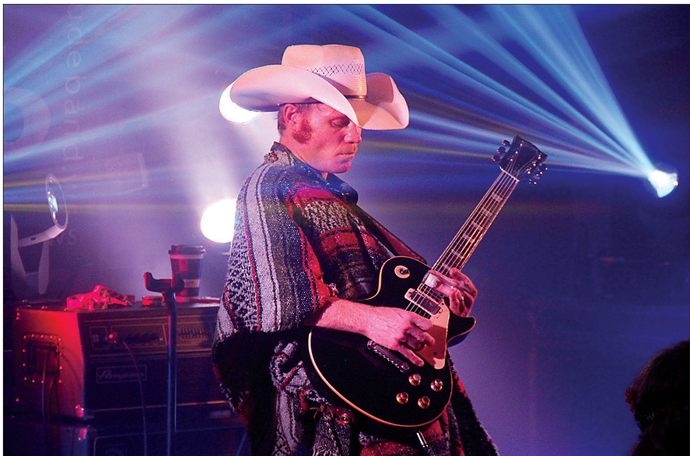
The Lugnuts teamed with the Rude Band to light up Yankton's Harvest Halloween Festival dance, held at the Old Brewery in downtown Yankton in October. (Hertz)

HAVE A PHOTO? Submit it to River City for publication in this space: RiverCity@yankton.net.