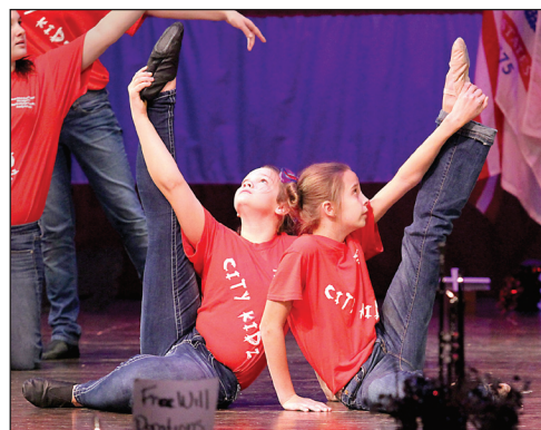
ABOVE: Yankton's City Kidz program presented a patriotic performance at the YHS/Summit Activities Center theatre in November to honor veterans just ahead of the Veterans Day holiday. (Hertz) BELOW: In December, the "Holiday Jam with the Hegg Brothers" returned to Yankton, putting on a colorful show at the YHS/Summit Activities Center theatre. (Hertz)