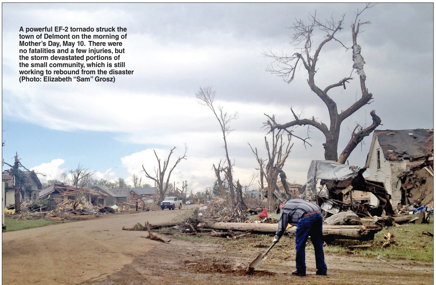
A powerful EF-2 tornado struck the town of Delmont on the morning of Mother's Day, May 10. There were no fatalities and a few injuries, but the storm devastated portions of the small community, which is still working to rebound from the disaster