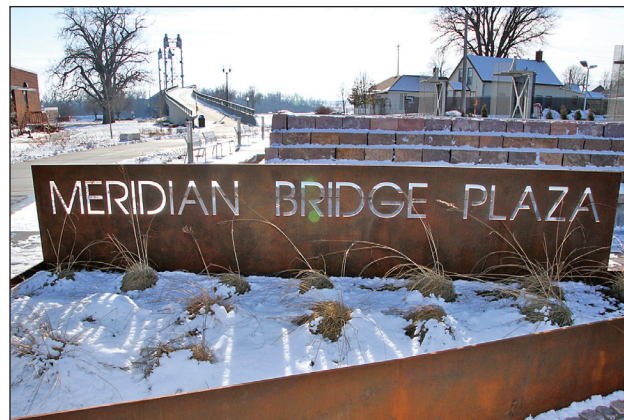
The Meridian Bridge Plaza fountain, completed this past summer, is part of the City of Yankton's efforts to revitalize downtown Yankton. The plaza will continue to be updated in the near future as city officials look at the long-term promise of the city's downtown district.

ing shape with the dawn of 2016. Businesses will be able to start applying for the city's facade improvement grant starting Jan. 1 while the next phase of the Meridian Bridge Plaza project will begin as soon as the weather improves. But long-term improvements, such as the Onward Yankton goal of turning Yankton into the entrepreneurship capital of the state, and others will take