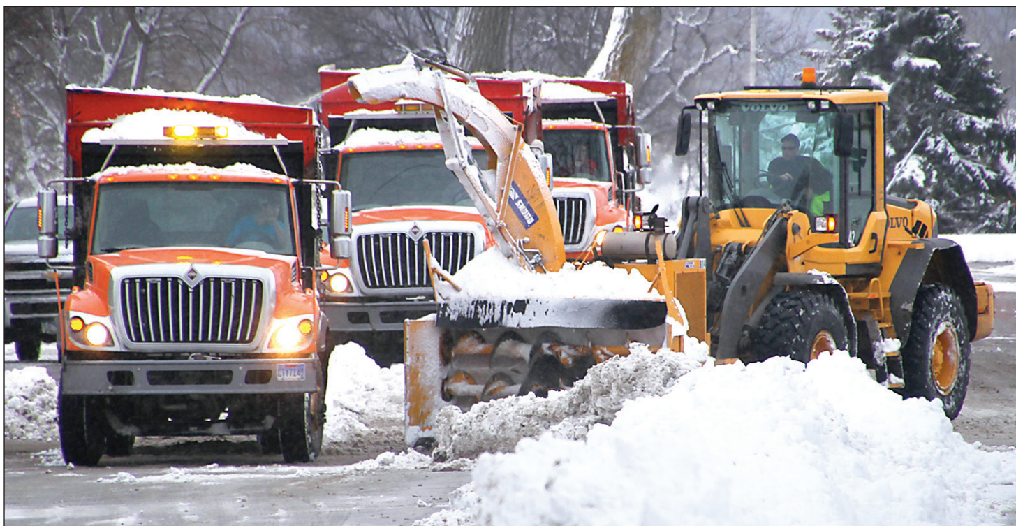
Yankton street crews were busy Saturday cleaning up the snow that fell late Christmas Day into the overnight hours. Yankton received 8 inches of snow from the storm — and more may be coming. At press time, Yankton County was under a winter storm watch for today (Monday) into Tuesday, while Clay and Cedar counties were under winter storm warnings. The National Weather Service said 6-10 inches of snow could be possible with the storm, the track of which was still uncertain late Sunday night. For more weather information, see page 2.