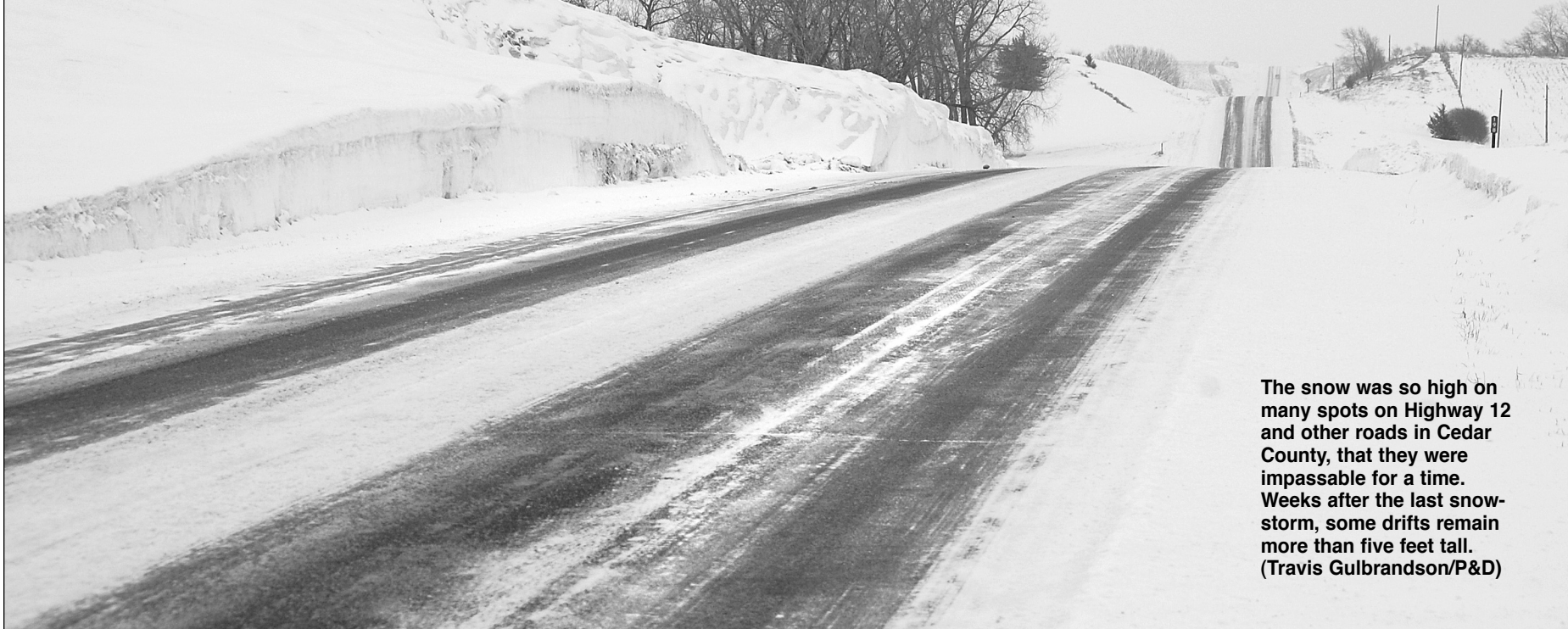
The snow was so high on many spots on Highway 12 and other roads in Cedar County, that they were impassable for a time. Weeks after the last snowstorm, some drifts remain more than five feet tall.

bit, the state's back out there. They go out at 3-4 a.m., and some of these last storms, they've been out 24 hours a day getting some of these paths opened up."