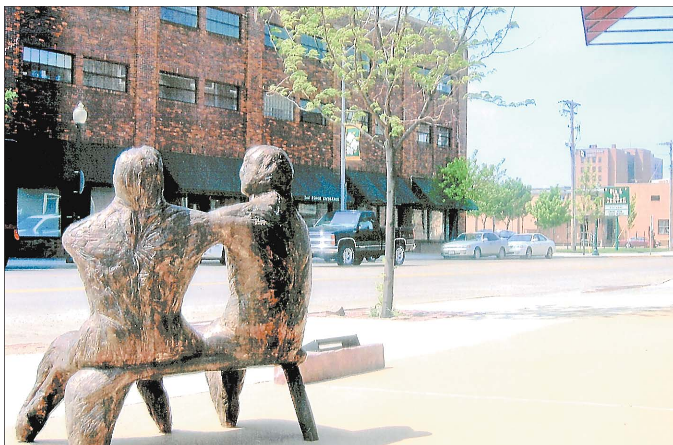
ABOVE: "Home" by Darwin Wolf was chosen as a 2010 RiverWalk sculpture and will be displayed in Yankton's downtown for one year. BELOW: This image depicts how the RiverWalk sculptures might be situated in a downtown area. Ten sculptures will be installed in the downtown district and in Riverside Park beginning this spring.

arctic cash win a 2010 700 mud pro atv! start qualifying january 1 st - february 25 th , 2010