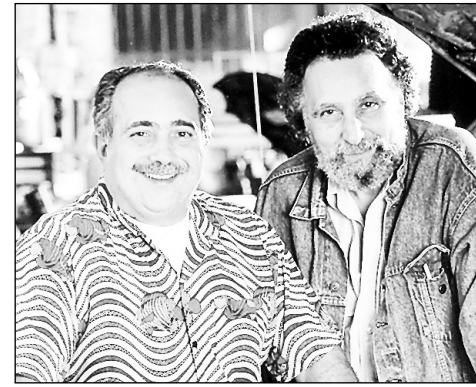
CLICK & CLACK

TOM: But once you get up to 40 mph or so, those small imperfections in weight balance will make your car shake like a half-prepared fruit smoothie still whirling around in