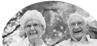
Here's What's Happening at...

The fraternity president told the campus newspaper the student suffered a head injury.