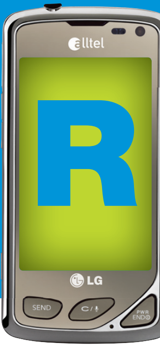
LG 8575 Touch

*Free after $50 mail-in rebate, with activation & qualifying 1-yr. agreement