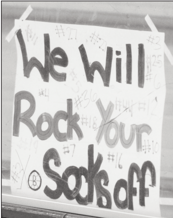
ABOVE: Signs of support, like this one from the Brookings Rangers, could be found all over Alcoa Arena during the first round of the S.D. State Girls' JV Hockey Tournament, which began Friday afternoon in Yankton.