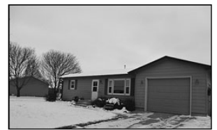
1104 West St. $124,900

Cozy home for sale or rent ($900/mo.) by owner in quiet neighborhood with many updates. Fenced in yard, shed, attached garage. (605)661-3507, shawnylynn@hotmail.com www.yankton.net/1103west/