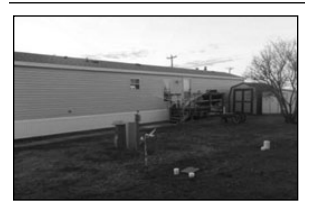
2800 Broadway #31 *Yankton 3-Bedrooms, 2-Bathrooms. 3000 sq. ft., Patio, Skylights, Laundry, Hardwood, Exposed Brick, and Jacuzzi. $1500/mo. 217 1/2 W Third Must See (605)661-9666.