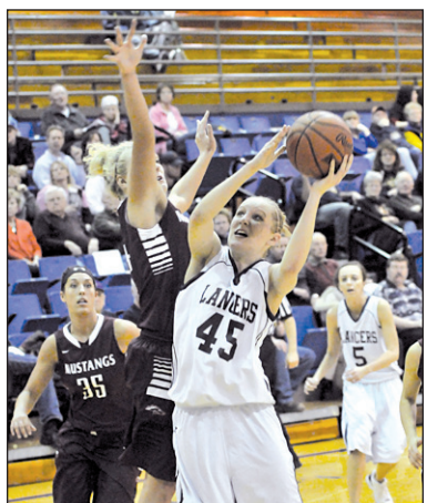
MMC Lancers Fall To #4 Morningside 54-65 ■ 8