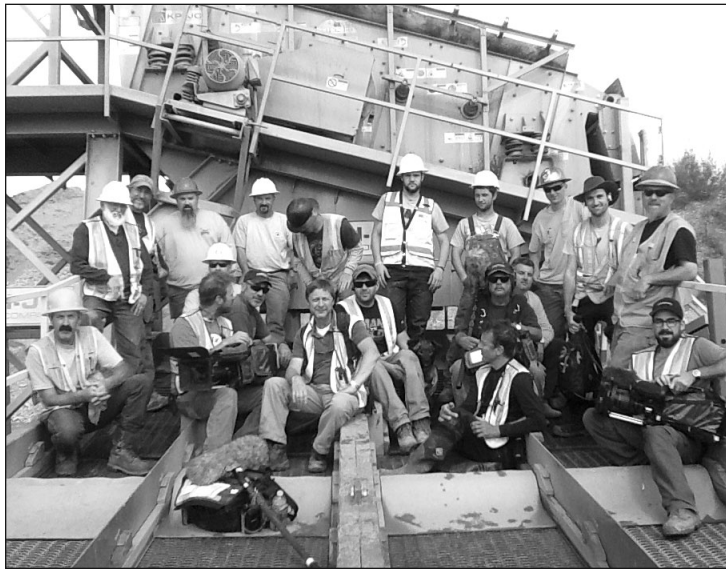
Some of the workers on the set of the Discovery Channel's hit show, 'Gold Rush.'