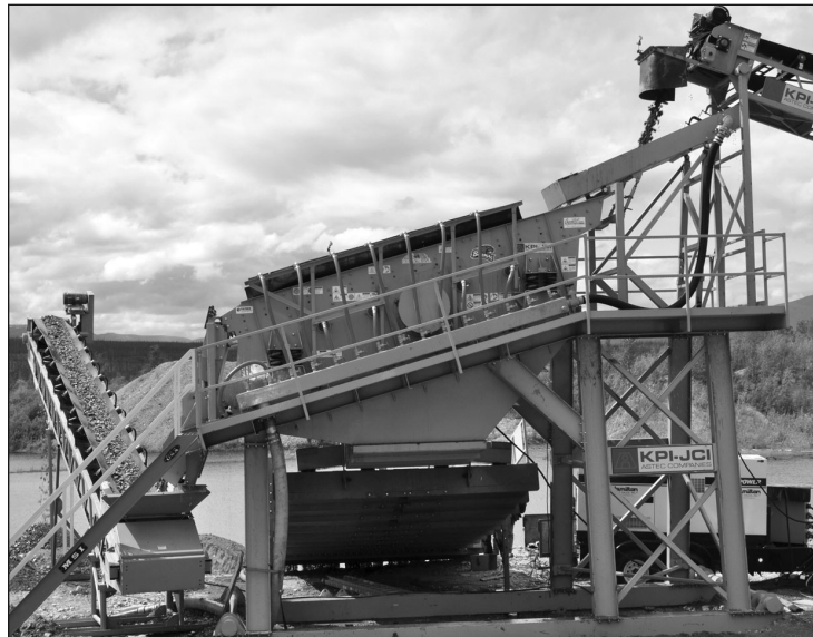
Some of the equipment on the show from Kolberg-Pioneer.

At the end of January, viewers watched as Hoffman shut down