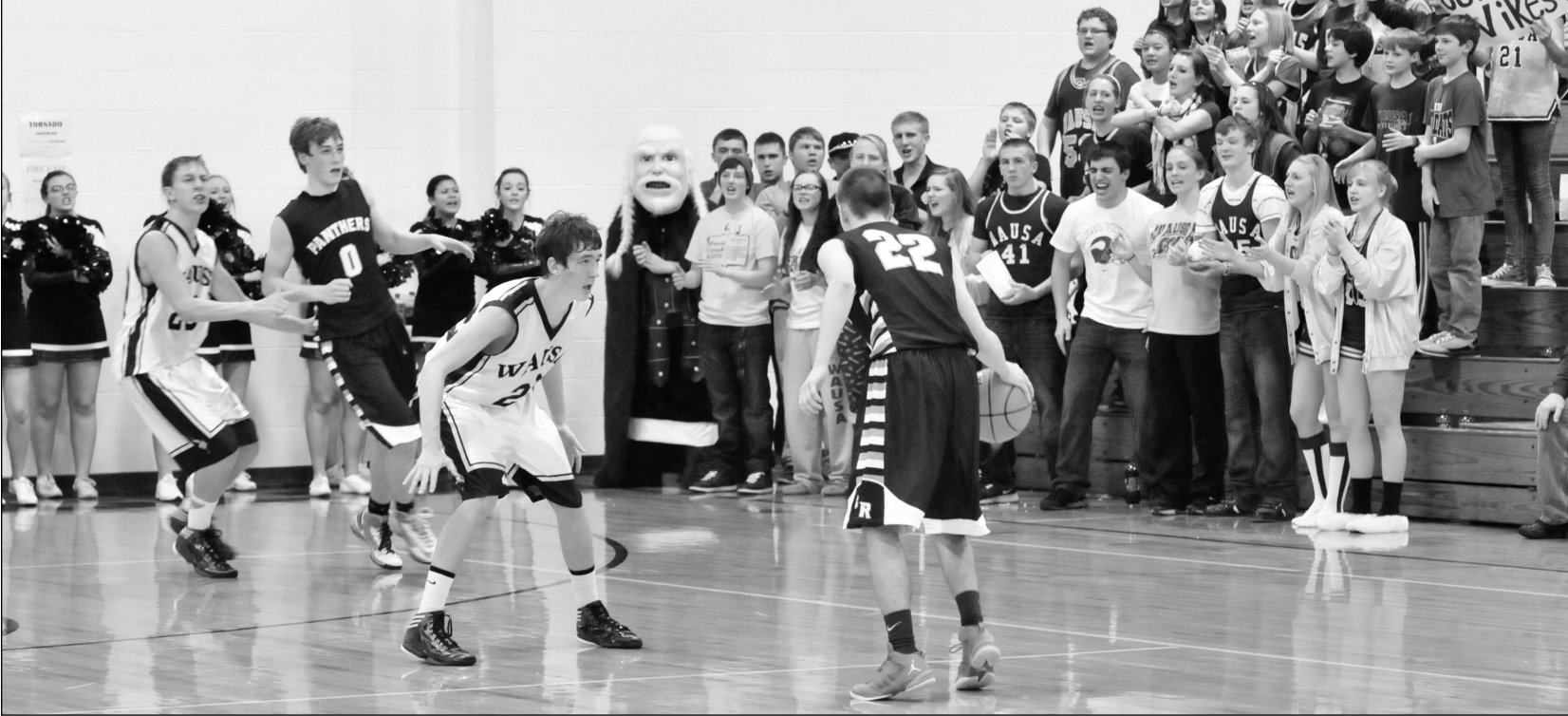
The Wausa student section and cheerleaders try to encourage the Vikings during the Lewis & Clark Conference boys' basketball championship game on Feb. 4 in Laurel, Neb. The Vikings (19-2) are hoping their fans will get the chance to cheer them on at state for the first time since 2003.