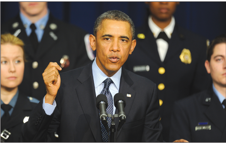
Surrounded by first responders who may be impacted by looming budget cuts, U.S. President Barack Obama speaks Tuesday during an event at the Eisenhower Executive Office Building in Washington, DC.

WASHINGTON — Ten days before a new deadline for broad, automatic government spending cuts, the sense of urgency that surrounded other recent fiscal crises is absent. Government agencies are preparing to absorb an $85 billion hit to their budgets, and politicians, at least for now, seem willing to accept the consequences. President Barack Obama, back from a Florida golfing weekend, warned Tuesday that "people will lose their jobs" if Congress doesn't act. But lawmakers weren't in session to hear his appeal, and they aren't coming back to work until next week. Still dividing the two sides are sharp differences over whether tax increases, which Obama wants and Republicans oppose, should be part of a budget deal. Obama cautioned that if the immediate spending cuts — known as sequestration — occur, the full range of government will