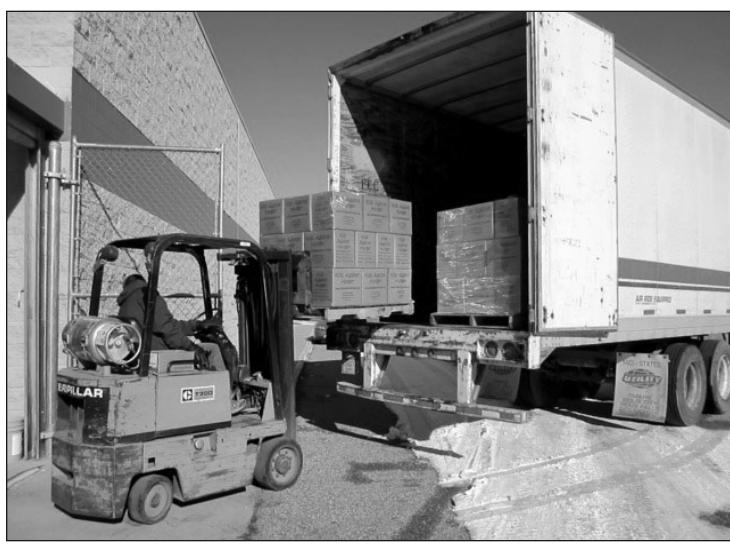
Garret Fast of Kids Against Hunger Yankton is pictured loading one of 12 pallets of food, over 85,000 meals...