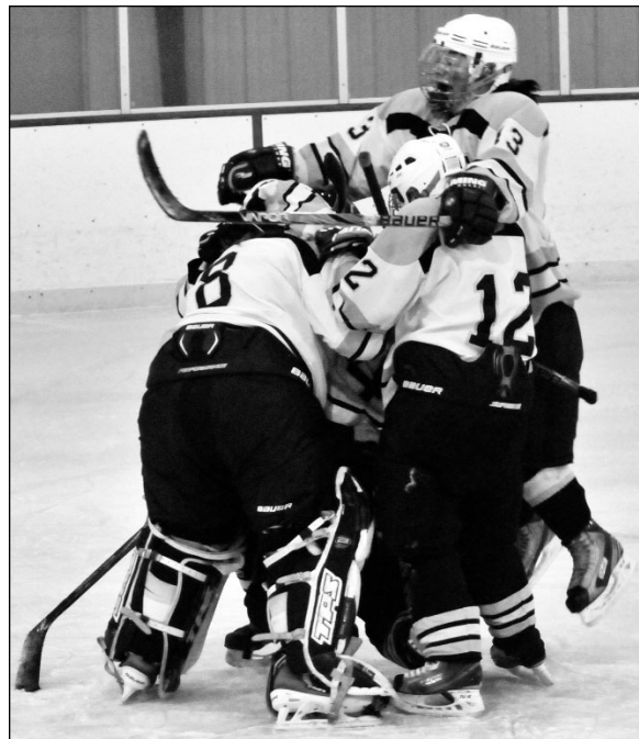
The Watertown Lakers celebrate their 3-1 victory over Sioux Falls in the championship of the South Dakota Amateur Hockey Association's JV Girls' Tournament on Sunday at Yankton's Alcoa Arena.