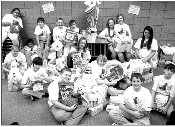
The students of Sacred Heart Middle School held a household item donation drive in conjunction with Catholic Schools Week, Jan. 28-Feb. 1. 436 items were donated ranging from food items to toys and games for kids. The donation of an item helped students achieve their "entry fee" into a school-wide dodge ball tournament. The items were divided between the Contact Center and the Yankton Women and Children's Center.