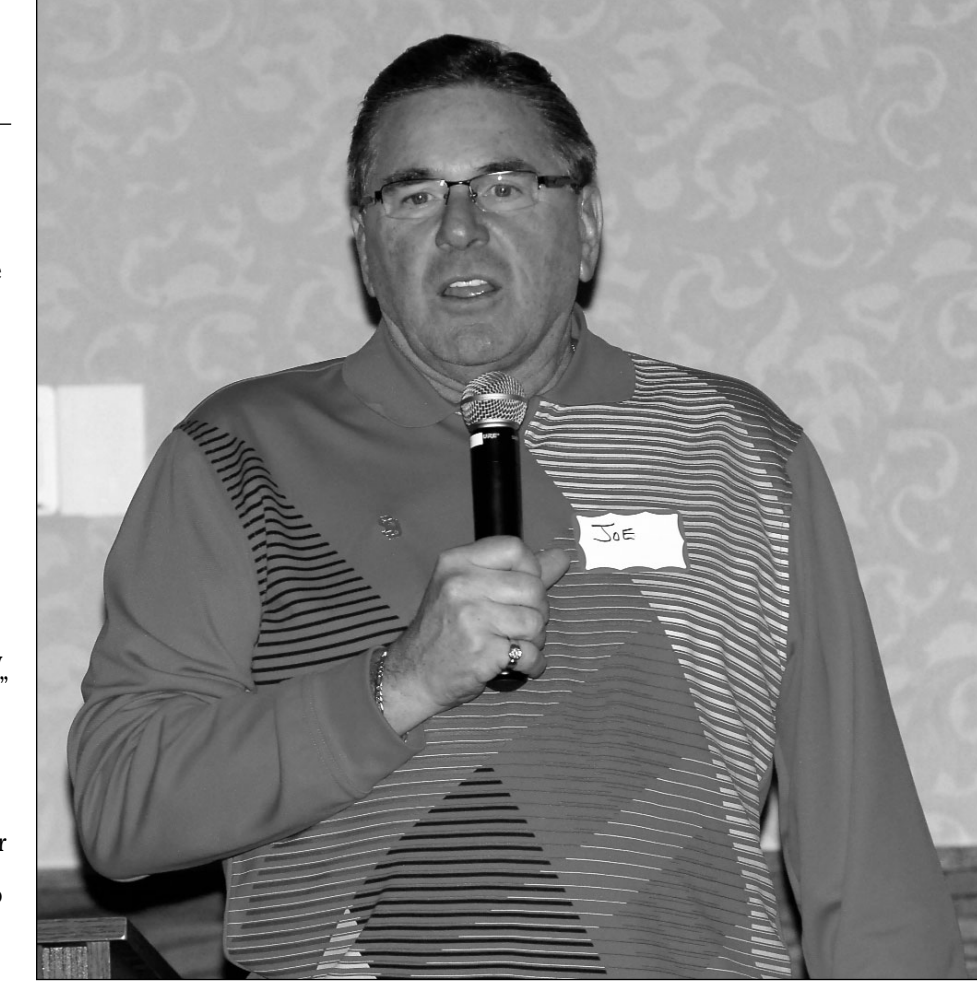
"It's literally a thing where we start at Old Main (on campus) and march out from there. You try and get everyone in your way."

other in-state recruits. Jensen was one of four preferred walk-ons from in-