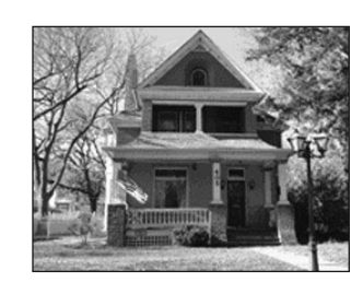
405 Pine • $149,900

4-Bedroom, 2-full bath, 1881 square feet, 2+ car garage. (605)660-7537 www.yankton.net/app/html/204 brown/