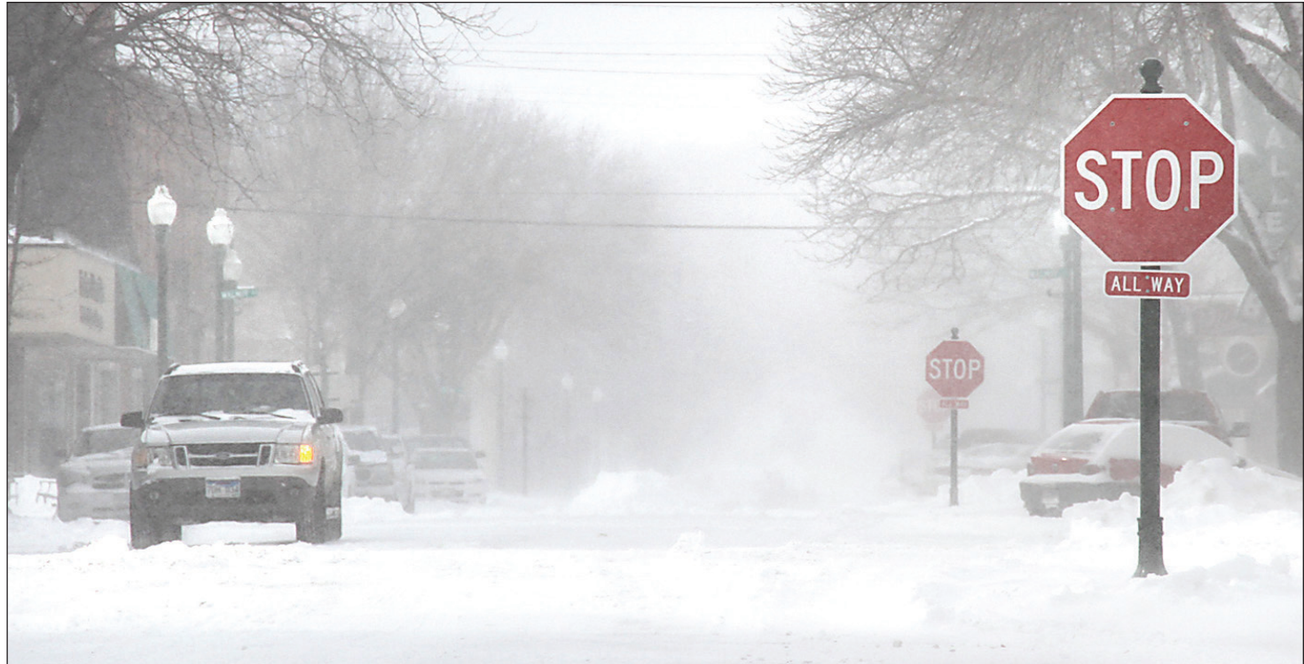
ABOVE: Gusty winds were still a problem for many motorists in Yankton Sunday afternoon after a major winter snowstorm unexpectedly trekked north and clipped the region. Yankton received at least 8 inches of snow from the system — referred to as Winter Storm Linus — before it headed east toward the Great Lakes and the eastern seaboard. It was reported Sunday night that at least 100 million people have been or will be impacted by the storm system. Bitter cold conditions followed in the wake of the storm. Seasonably chilly temperatures are expected to hang on in the Yankton area until the end of the week. For details, see page 2.