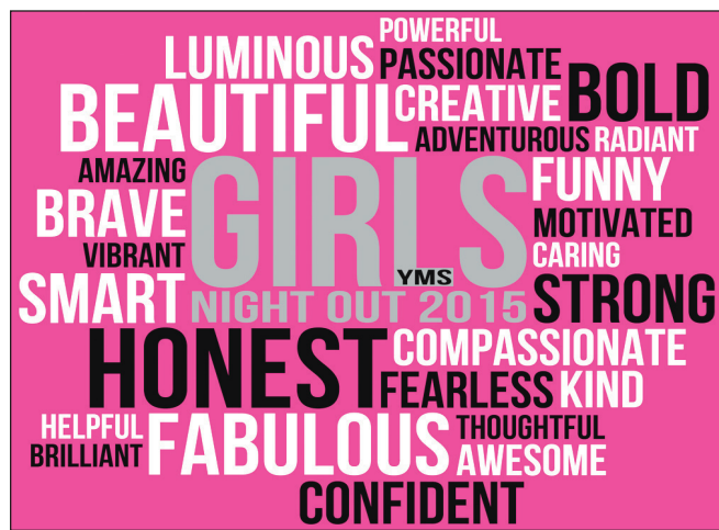
This logo adorns the T-shirts that are being provided to participants in Yankton Middle School's "Girls Night Out" event, set for Friday night at YMS.