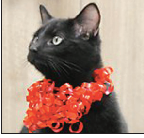
For more information, call (605) 664-4244 or e-mail hhs@midconetwork.com. Visit the Humane Society's website at www.heartlandhu-

The Heartland Humane Society has the following pet available: "Bagheera is a wonderful natured kitten that loves to cuddle. He is 6 months old and very affectionate. Bagheera likes to be held, pet and loves to play. He'd make a great addition to a family. Bagheera has been neutered, fully vaccinated and micro-chipped. Call Heartland Humane Society at 605-664-4244 for more information."