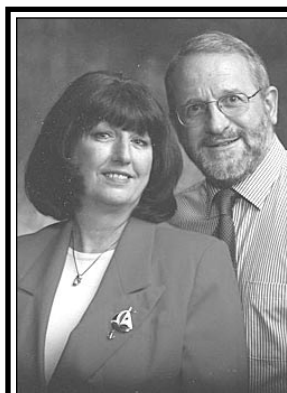
Homes for Sale: