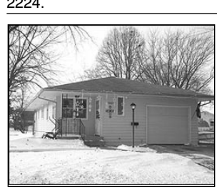
2001 Ross St.