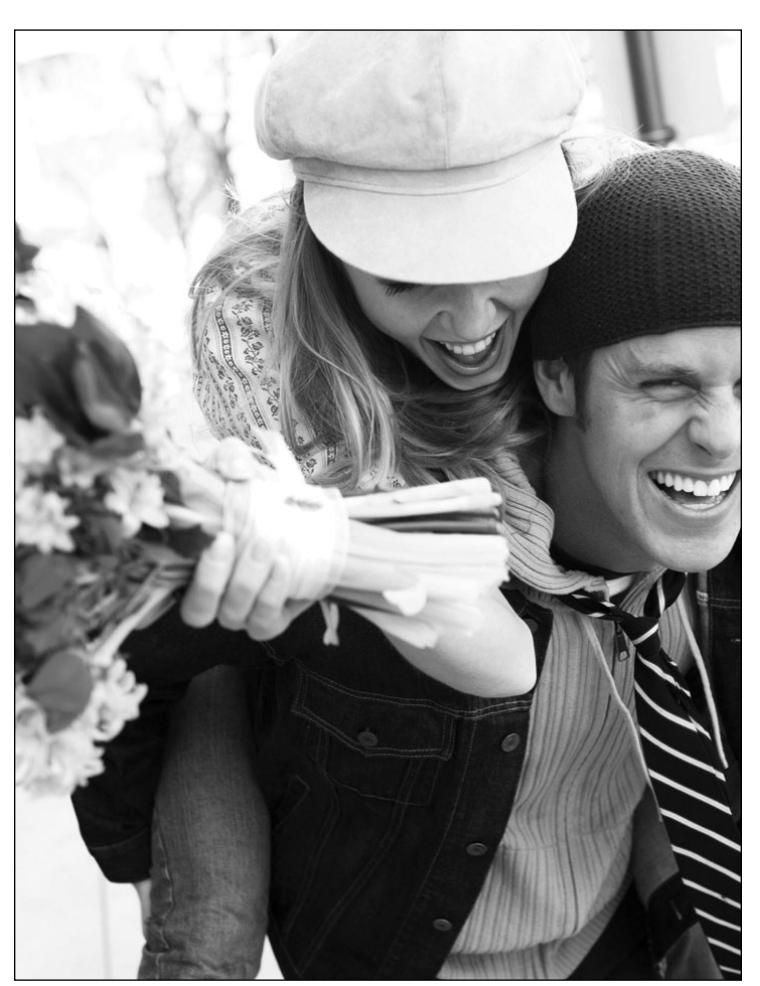
Engagement photos don't have to be posed portraits. Experiment with looks that fit your personalities for memorable photos.