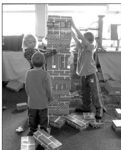
Preschoolers learn about cooperation while building this tall tower.