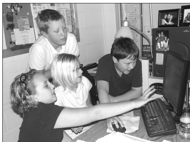
4th and 5th graders at St. Agnes collaborate together on choosing a layout design for the school newspaper, "Agnes Action."