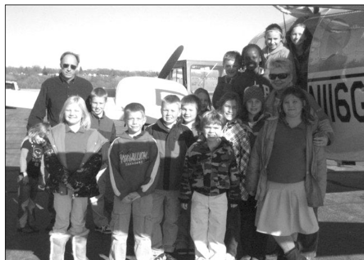
St. Agnes 3rd Grade Field Trip to the Vermillion Airport