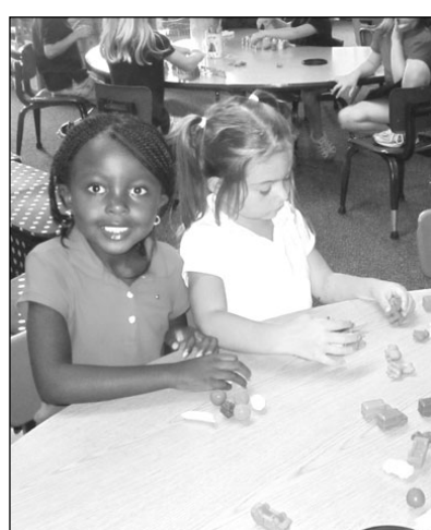
Kindergarten students enjoy working in small groups during hands-on math activities.