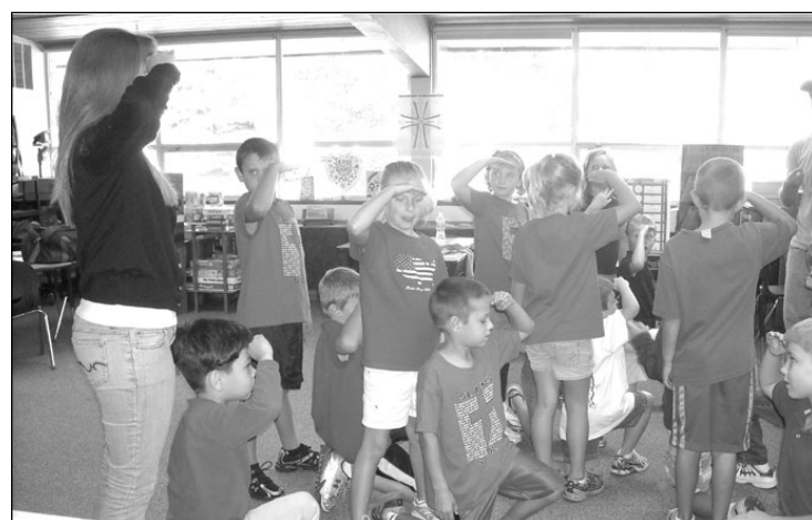
The second grade class learned a new game during their "Up With People" visit in September.