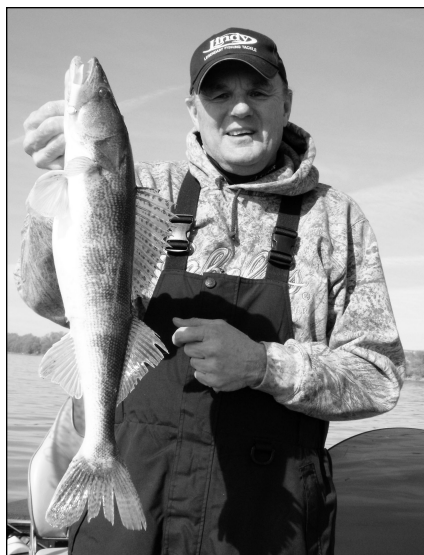
Waterfowl hunters will still have a chance for one more pass, decoying ducks and geese during the late waterfowl season.